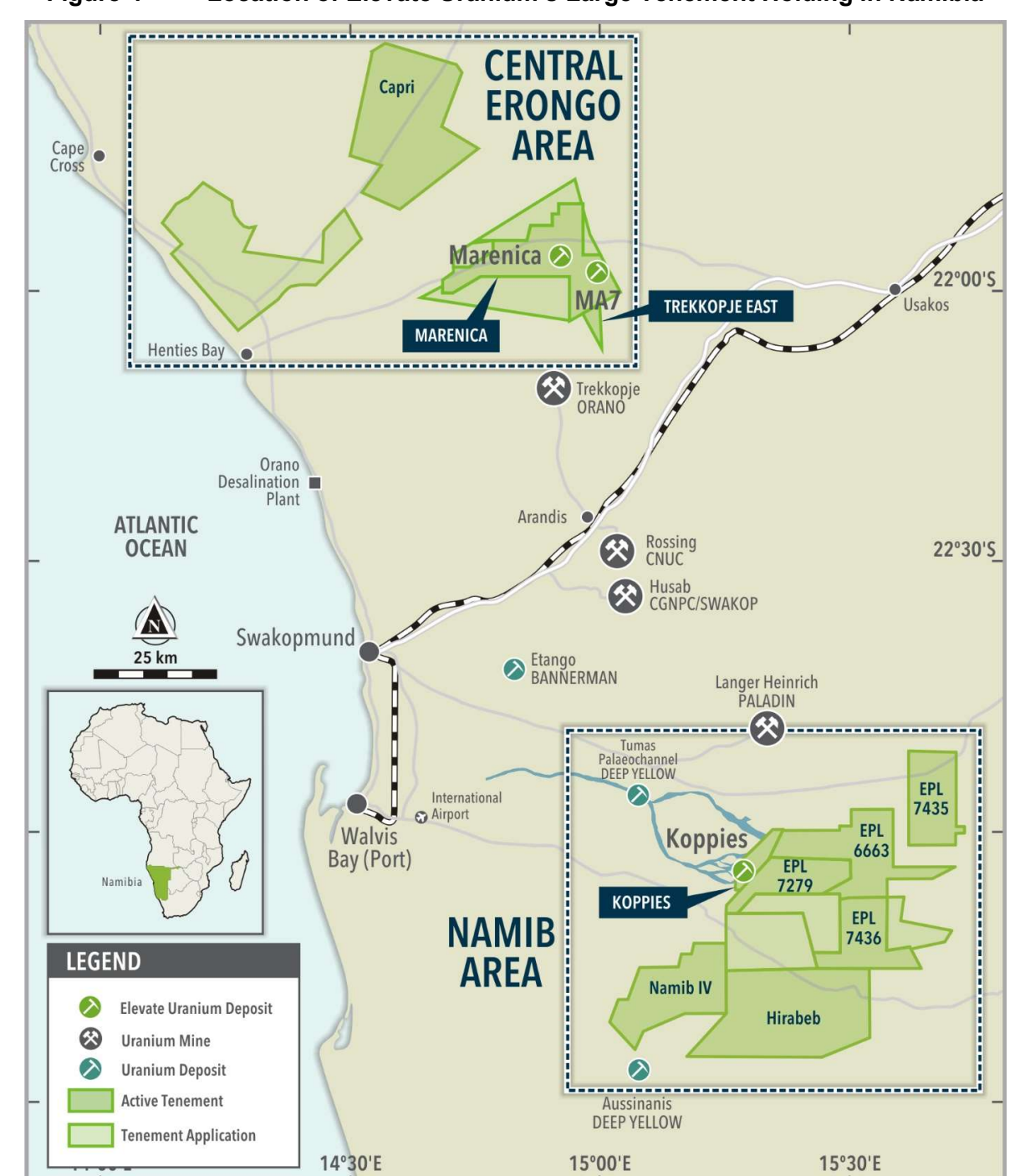
Figure 4 Location of Elevate Uranium's Large Tenement Holding in Namibia