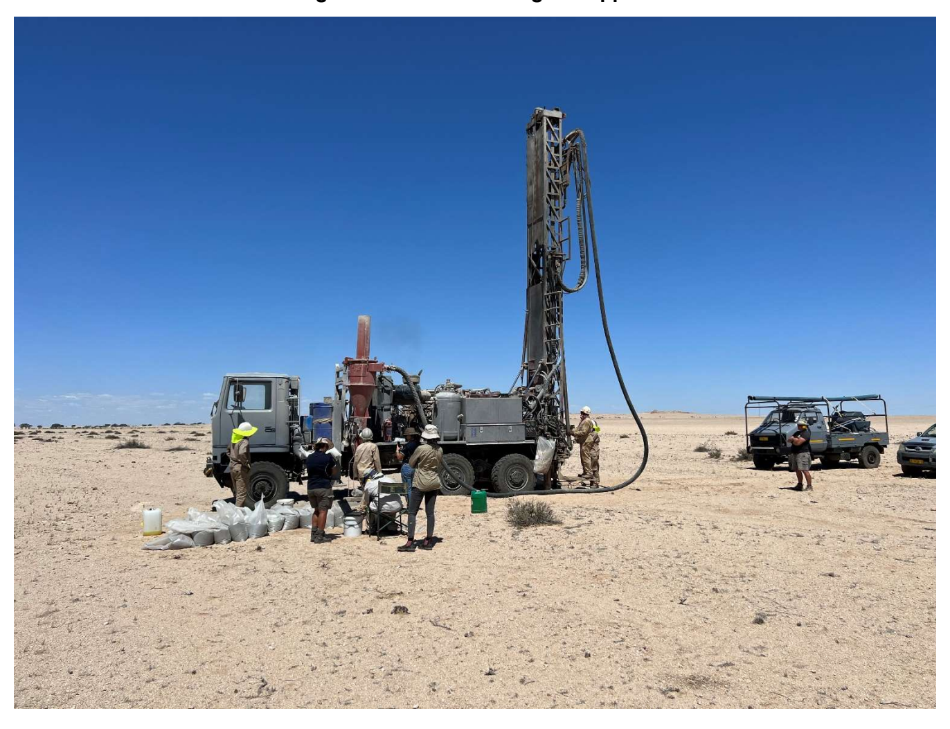
Figure 1 RC Drill Rig at Koppies

era for the Company. The focus will change to advancing the Koppies Uranium Project through infill drilling and metallurgical testwork that will underpin technical studies and a future pilot plant. And all this is happening with the U_3O_8 price shooting through US$100/lb, its highest level for 15 years."