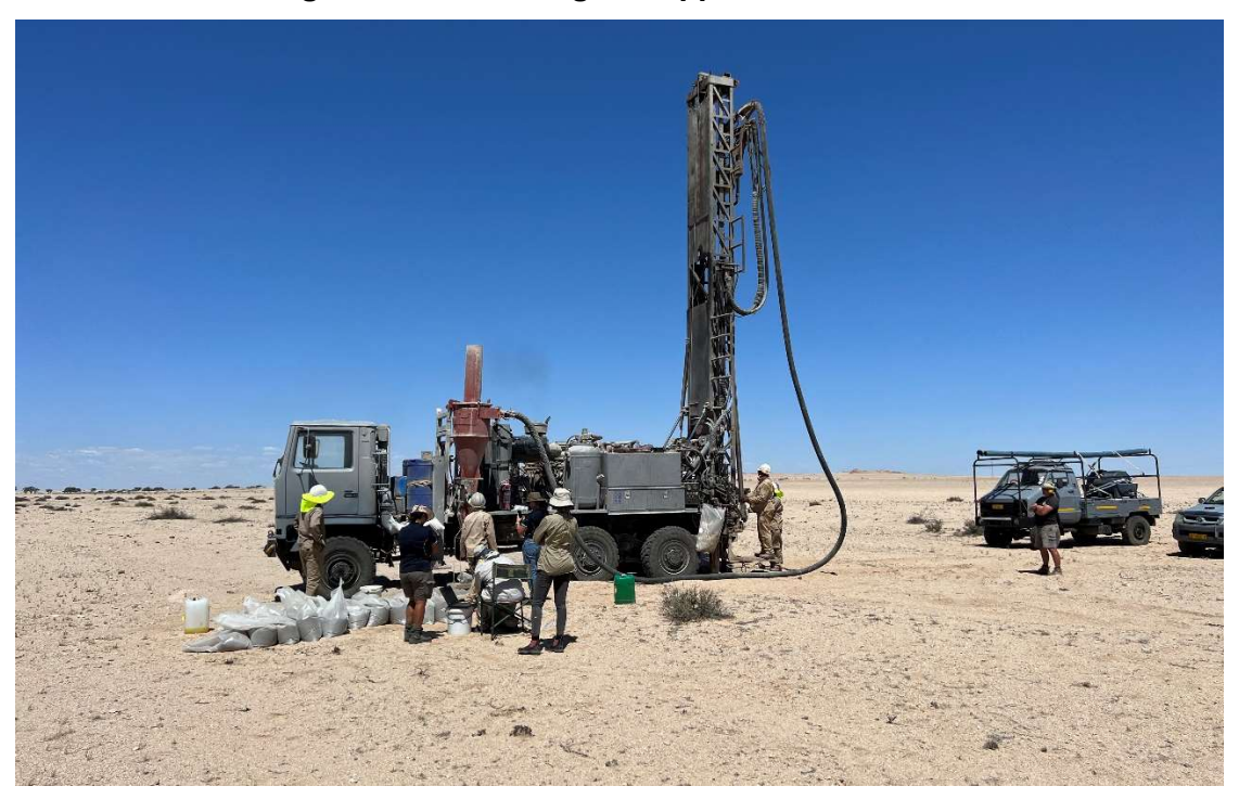
Figure 2 Drilling at Koppies 2 Extensions