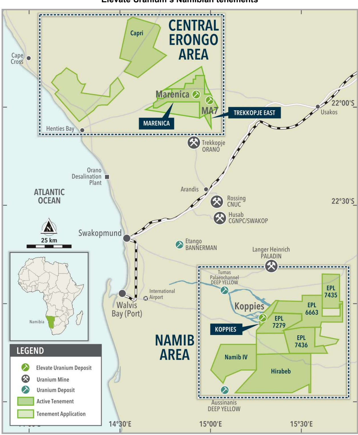
Figure 4Location of Koppies and Ganab West with respect to<br/>Elevate Uranium's Namibian tenements