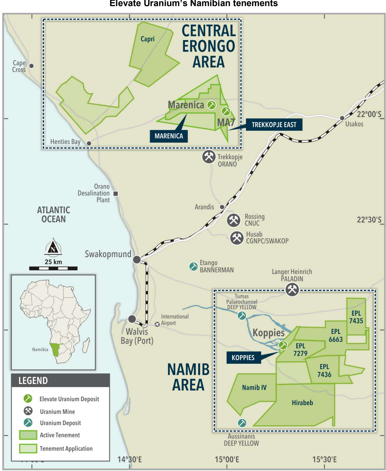
Figure 5 Location of Koppies and Ganab West with respect to Elevate Uranium's Namibian tenements