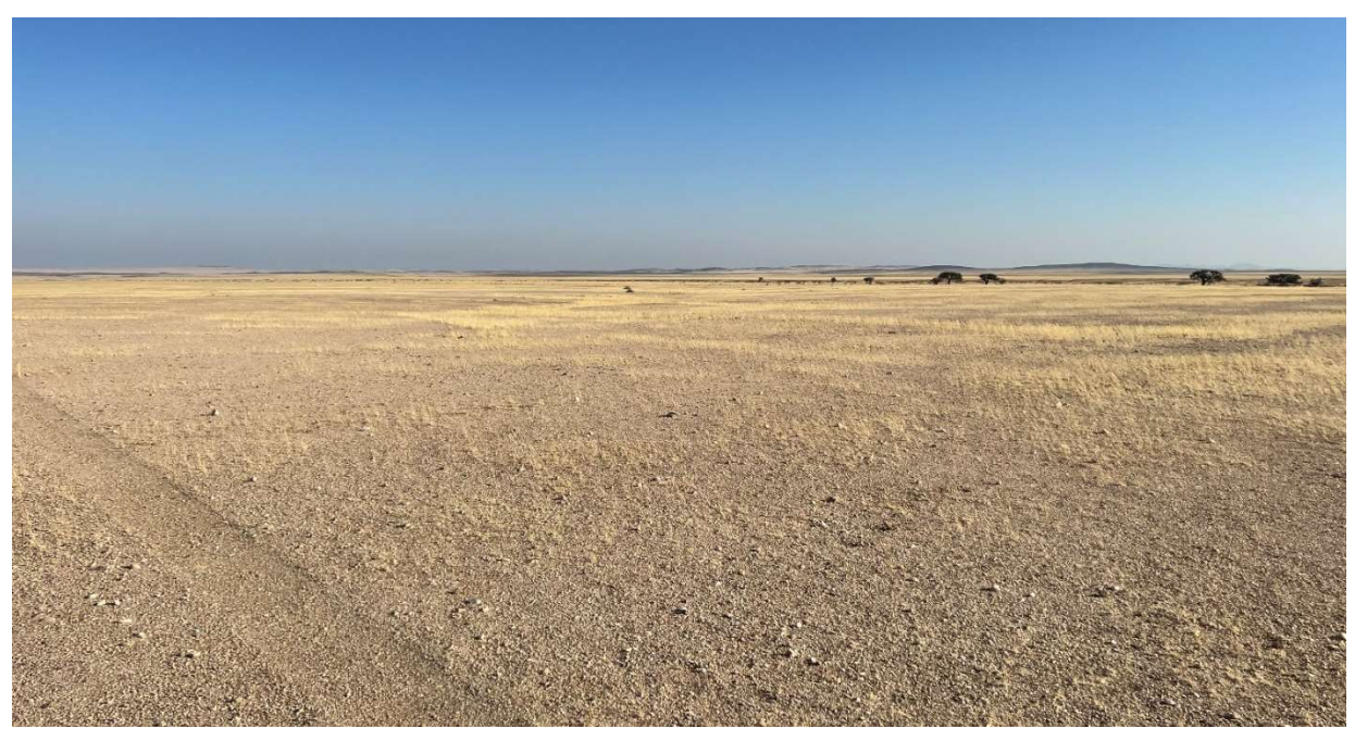
Figure 2General View of the Koppies Topography