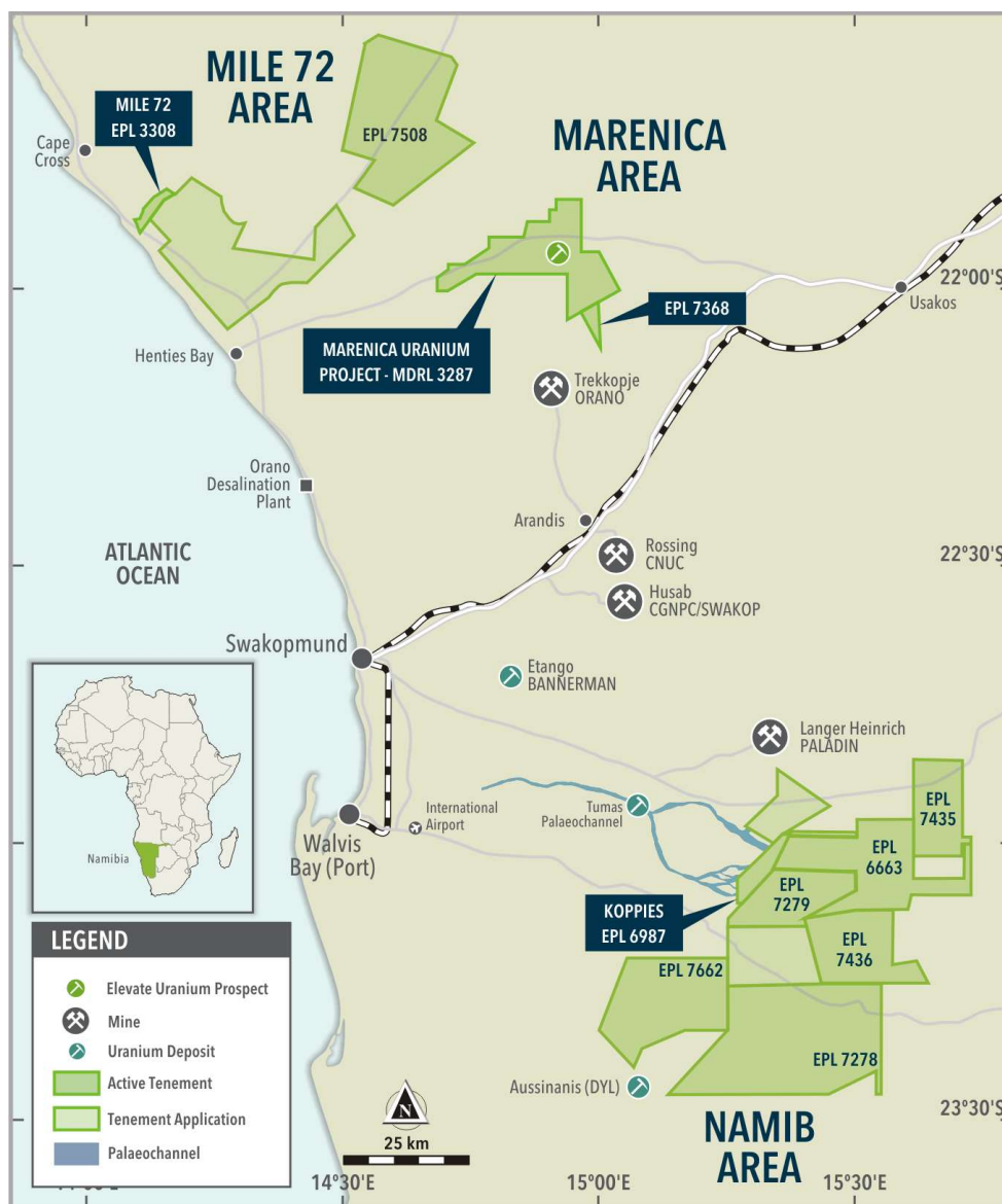
Figure 3 – Location of the Namib Area, Namibia

The Company will now design and undertake drilling programs to physically confirm the existence of the palaeochannels and determine the grade of uranium mineralisation. Due to the large and extensive area of these palaeochannel systems, the drilling programs are expected to continue into 2022.